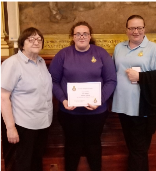
2nd East Kilbride Girls' Brigade

Please pray for us this session as we look to strengthen our leader numbers, and also the girls' understanding of GB overseas.